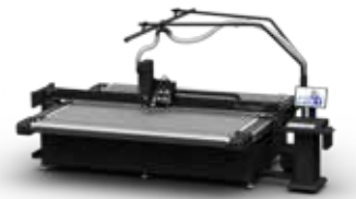
MCT VersaTech2 Digital Cutter

MCT of Wisconsin, Inc. has a combined 80 plus years of experience in print, finishing, and digital die cutting solutions for specialty graphics. The founding team of MCT comes out of Mikkelsen Graphic Engineering, which pioneered using digital flatbed cutters to accurately "cut to print," and essentially founded the current flatbed cutting marketplace for grand format printers. The combined people and product experience makes MCT one of the most knowledgeable companies in the industry in regards to digital finishing, the materials used and their specific best finishing methods.