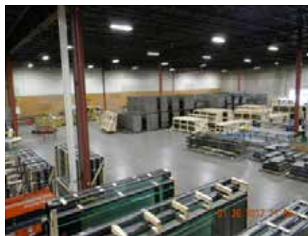
FrēMarq orders completed and ready to ship

FrēMarq's patented thermal break technology results in the creation of the first line of customizable curtain walls for buildings today, and well into the future, all at a cost that is competitive with less effective existing systems. All this results in enhanced ROI for building owners around the world.