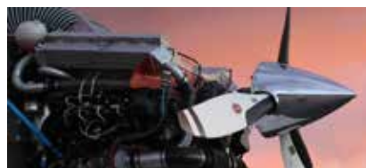
EPS Graflight V-8 Engine

Engineered Propulsion Systems, Inc. (EPS) brings advanced diesel aviation engine technology to today's modern airplanes. The company's engine uses diesel fuel instead of the environmentally unfriendly leaded airplane fuel currently in use. Engine and flight tests are currently underway and EPS expects FAA approvals during 2017. EPS was also a recent recipient of a contract awarded by the US Air Force.