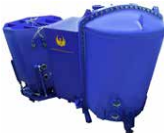
Phoenix Nuclear Lab - High Yield Neutron Generator

Phoenix Nuclear Labs (PNL) has developed a new class of intense neutron generators that can satisfy unmet market application needs within areas like radiography and the production of medical isotopes. It uniquely does it without the need of a nuclear reactor.